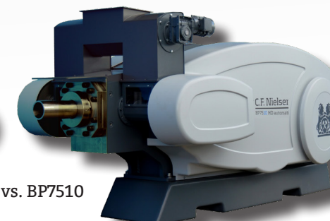
BP6510 vs. BP7510