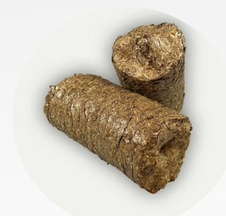
Ø90 Wheat straw