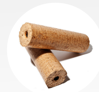
Ø90 Softwood w/hole